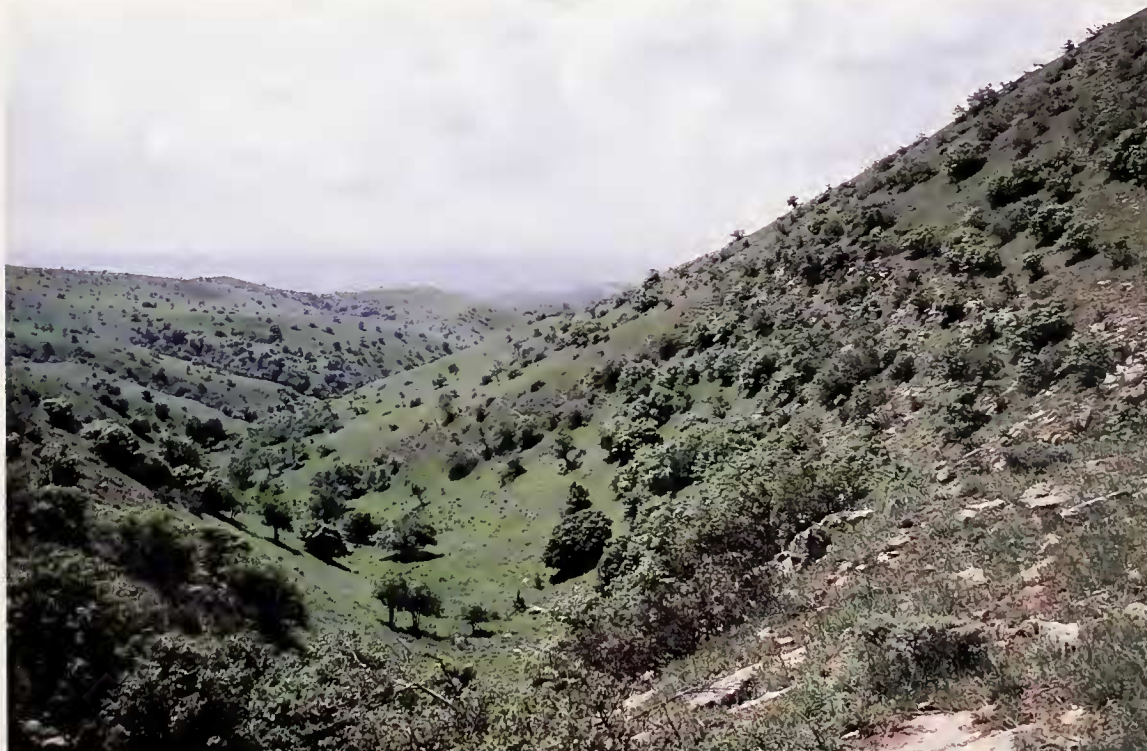
Type locality of Coiluber atayevi , environs of Saivan Village, Saivan-Nokhur Plateau, western Kopet-Dag, Bakharden Region, Turkmenistan.